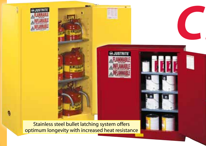
Stainless steel bullet latching system offers optimum longevity with increased heat resistance

Choosing the proper door style is important!