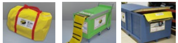
Deployment methods for Water-Gate