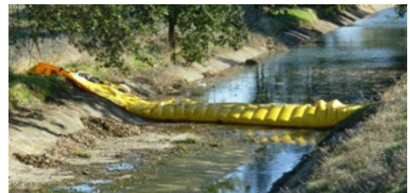
Water-Gate in water application