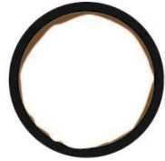
BioOne treated drain line after 8 weeks