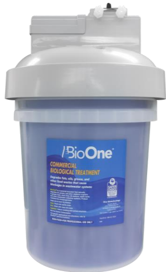
90 Day Auto-Dispensing