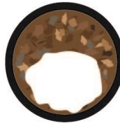
BioOne treated drain line after 3 weeks