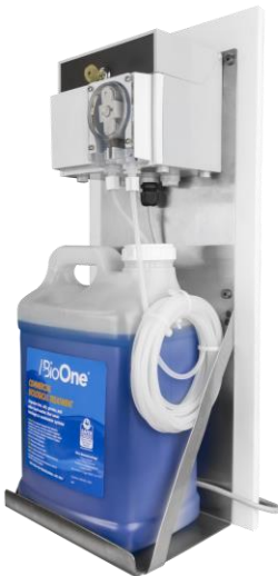
60 Day Auto-Dispensing