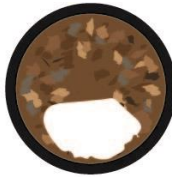
BioOne treated drain line after 1 week