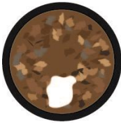
Grease obstructed drain line